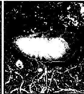
Japanese beetle pupa.