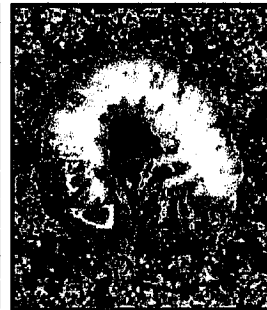
Japanese beetle larva.